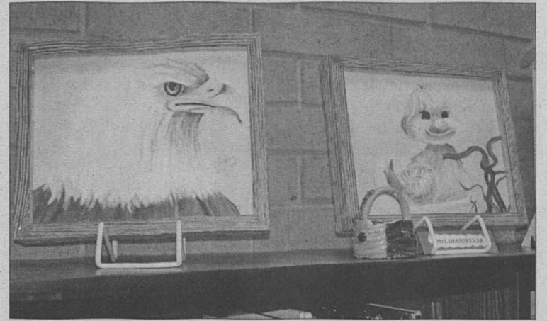
have created beautiful art. These are students of Lois Raabe's Little Red Art Studio. Come by. Look See what our kids can do.