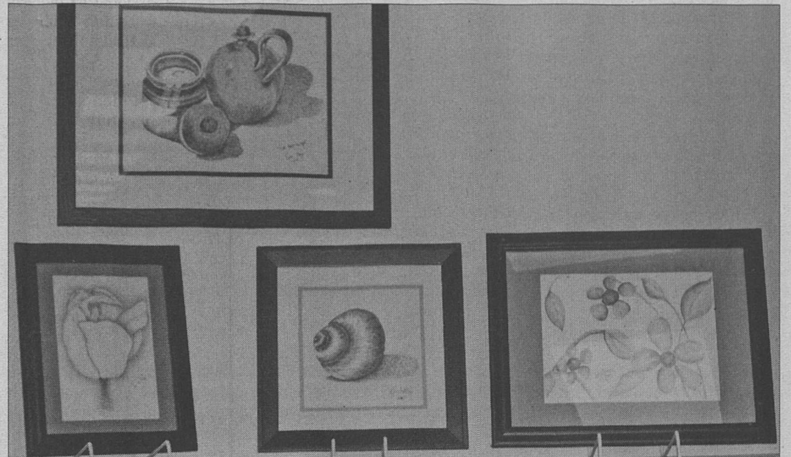
Pictured is just some of the artwork on display at the Wintermann Library.